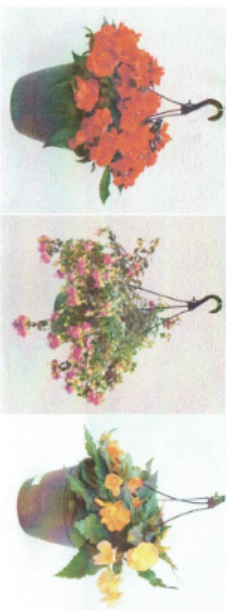
New Guinea Impatiens